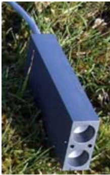
FIGURE 1 Double pyroelectric sensor developed by Eco-counter.

Existing information on the accuracy of the dual-sensor device is limited. The manufacturer claims accuracy within 5 percent (17), but acknowledges the device may miss adjacent pedestrians. An informal, 2-hour long check of the counter was undertaken by the Vermont Agency of Transportation (16) on sidewalks in the state capital Montpelier. It showed a high accuracy, since manual counts confirmed accuracy of 98%.